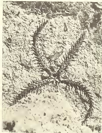
DOYLE, Shasticioceras anglicum SKWARKO, Nullamphiura felli